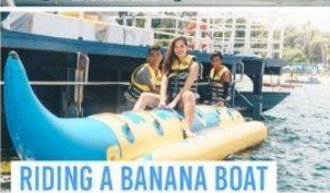
RIDING A BANANA BOAT